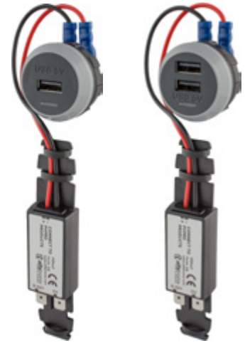
PVPro-S with PVPro-F filter

However, if the system specification requires galvanic isolation, then the PVPro range units can be used in conjunction with the Alfatronix PV6i-R or PV12i-R isolated railway approved converters. These units have also been tested as a system to EN 50155.